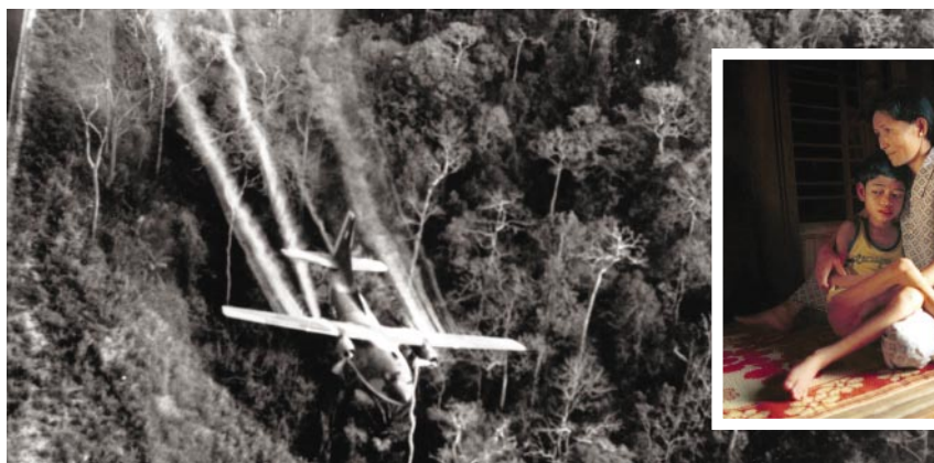
Up to 4 million Vietnamese may have been affected by American wartime defoliant spraying.

Like a widely cited 1974 National Academy of Sciences study on Agent Orange, the